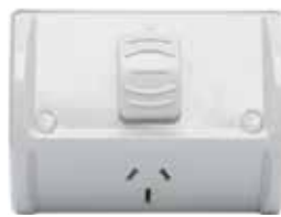
ATPP1-GY SAP CODE: 5000251

/ Single, Rectangular, 10A 250V a.c., IP54, Grey