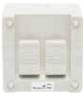
ATS116/2-GY SAP CODE: 5000330