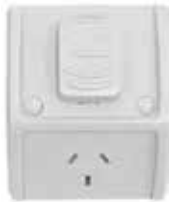
ATPP1S-GY SAP CODE: 5000250

/ Single, Square, 10A 250V a.c., IP54, Grey