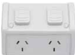
ATPP2N-GY SAP CODE: 5000252

/ Double, Rectangular, 10A 250V a.c., IP54, Grey