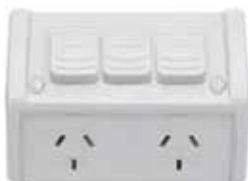
ATPP2X-GY SAP CODE: 5000253

/ Double, Rectangular, 10A with Extra Switch, 250V a.c., IP54, Grey