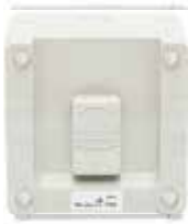
ATS116-GY SAP CODE: 5000329